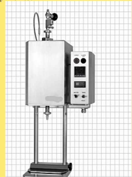
Static Fluid Loss Cell HTHP

Make sure you inquire about annual maintenance charges as applicable of equipments.