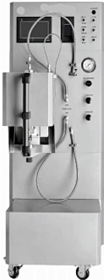
Stirred Fluid Loss Cell