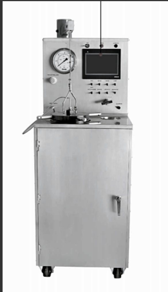
HP HT Consistometer

API SPECIFICATION, HIGH QUALITY AND SYSTEM EQUIPPED WITH DURABLE ELECTRONICS