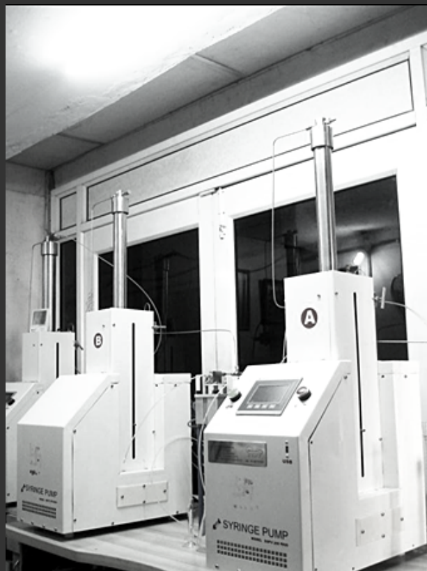
Dual HP Syringe Pump

API SPECIFICATION, HIGH QUALITY AND SYSTEM EQUIPPED WITH DURABLE ELECTRONICS