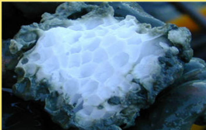
Gas Hydrate Autoclave

The above mentioned equipment's includes, complete Core flooding apparatus including core holder, accumulator cell, syringe pump, and accessories. Reservoir engineering equipment's models are bench top and easy to carry or relocate.